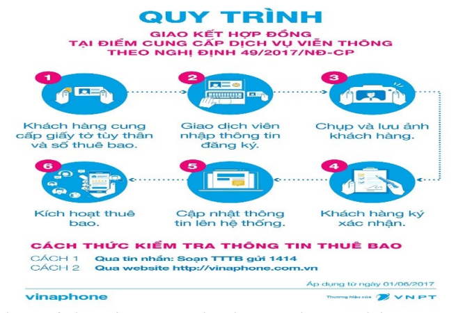
Figure 2.1: Telecommunication service provision process

Step 3: Connect broadcasting stations with the switchboard Telecommunication service production process has transmission line.